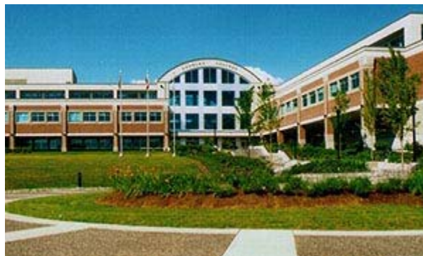
Pinetree Way entrance of the David Lam Campus