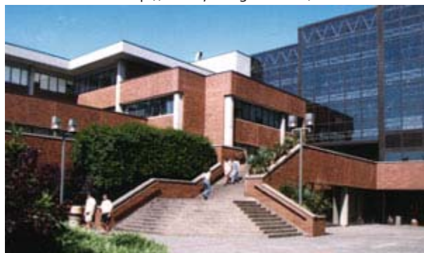
New Westminster Campus 8th Avenue Entrance