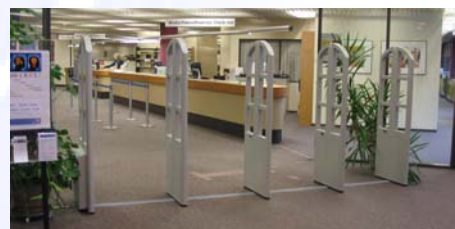
New Security Gates at New Westminister Campus